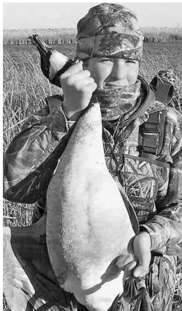
A proud veteran displays a Canada goose taken on a hunting outing sponsored by the Operation Injured Soldiers organization.